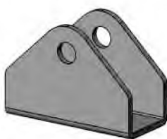
Adjustable stairs foot